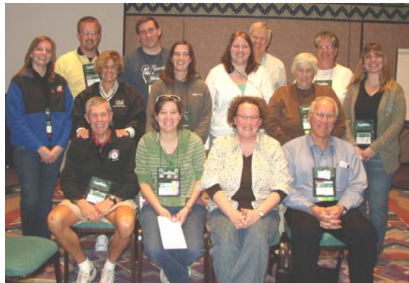
Most of the Great Rivers Section members attending the ACA National Conference came to the section gathering on the first night.

Orlando, Florida was a wonderful location for a conference in February and twenty-six members of the Great Rivers section attended! The ACA National Conference was filled with informative sessions, relevant new ideas and terrific speakers. Popular sessions included those sharing new program ideas, staff training tips, dealing with bullying, using social networking/Web 2.0 sites to engage and train staff, and sessions on characteristics of millennial-aged staff and how best to work with them.